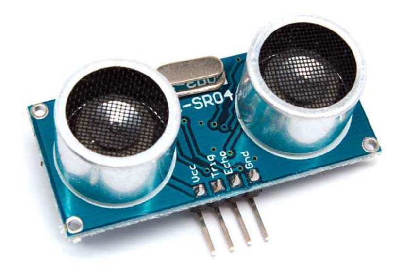
Vcc Trig Echo GND